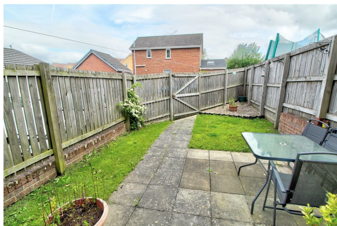
Externally a small garden to the front and to