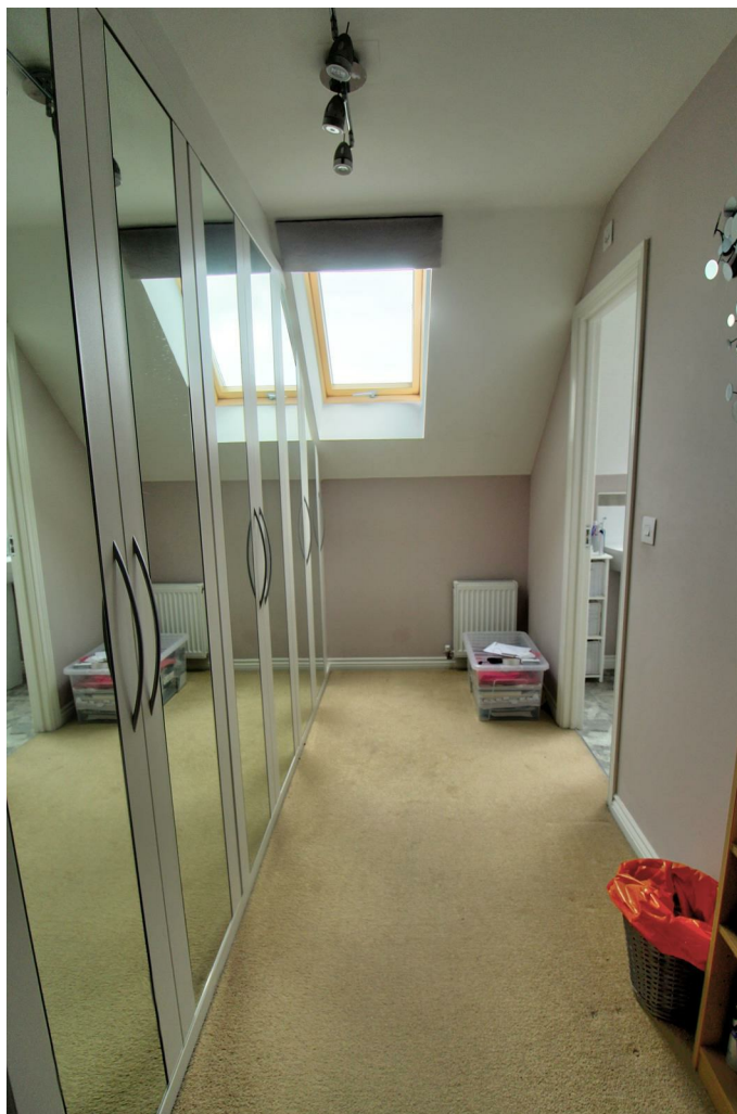
Velux window, radiator, loft access, fitted wardrobes.