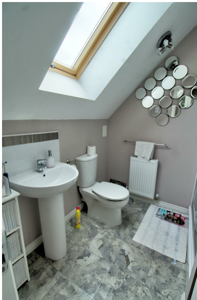
White suite with chrome effect fittings comprising: Low level W/C, pedestal wash basin, shower cubicle, part tiled walls, heated towel rail, extractor fan, Velux window.